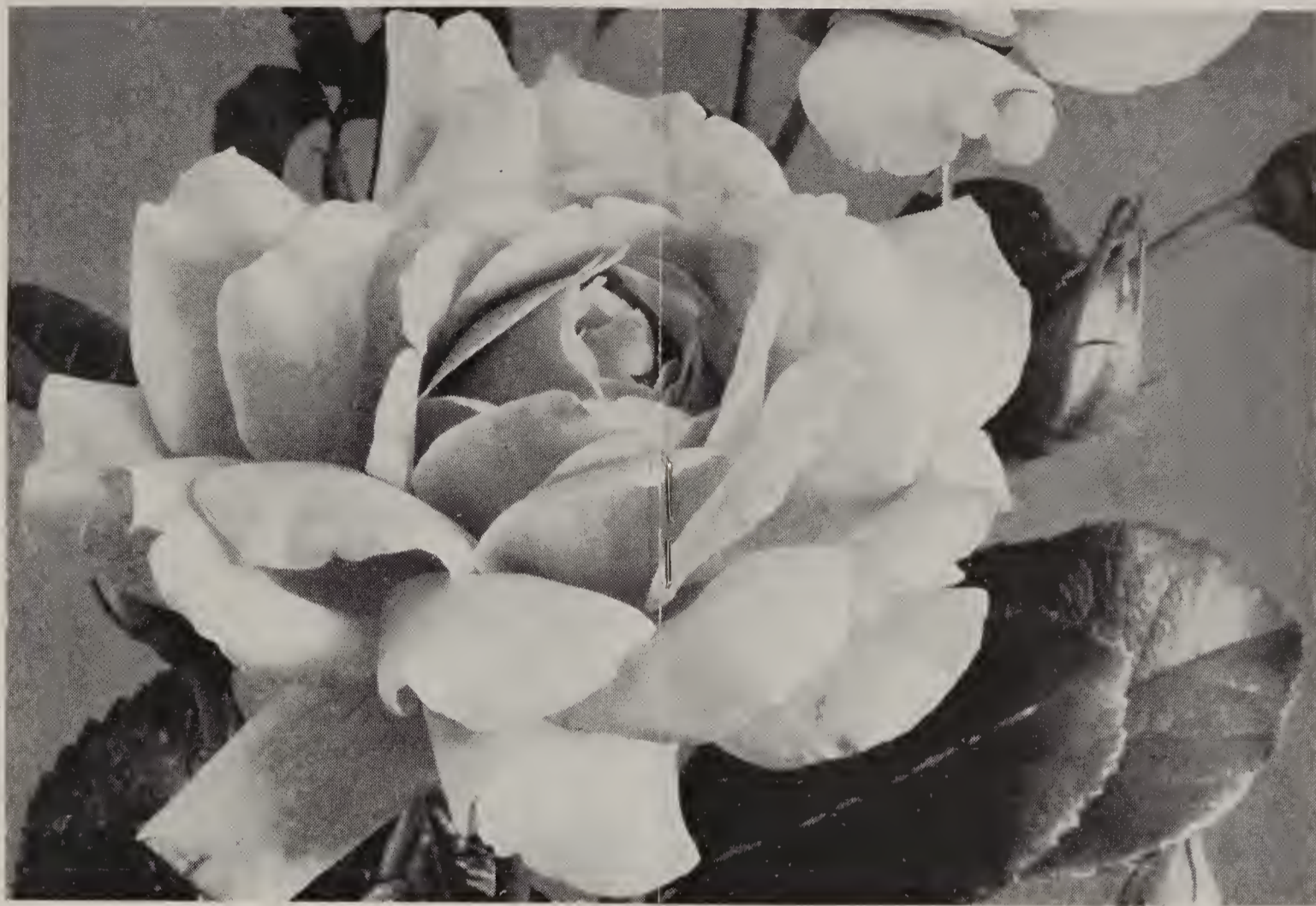
Note abundant petalage and grace of this novelty: Ramon Bach